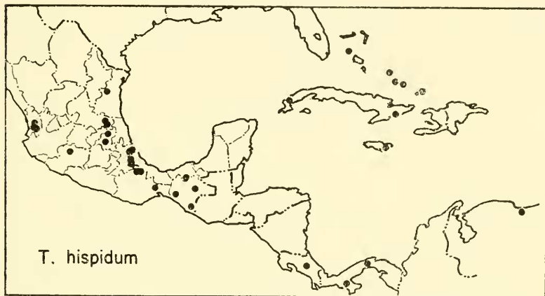
Map 3. Distribution of Theridion hispidum O. P. Cambridge.

female from Panama measured 2.5 mm. total length. Carapace 0.95 mm. long, 0.80 mm. wide. First femur, 1.82 mm.; patella and tibia, 1.57 mm.; metatarsus, 1.43 mm.; tarsus, 0.52 mm. Second patella and tibia, 1.10 mm.; third, 0.70 mm.; fourth, 1.05 mm. Total length of males 1.6-2.2 mm. A male from Panama measured 1.6 mm. total length. Carapace 0.91 mm. long, 0.81 mm. wide. First femur, 1.82 mm.; patella and tibia, 1.91 mm.; metatarsus, 1.51 mm.; tarsus, 0.55 mm. Second patella and tibia, 1.24 mm.; third, 0.65 mm.; fourth, 0.98 mm.